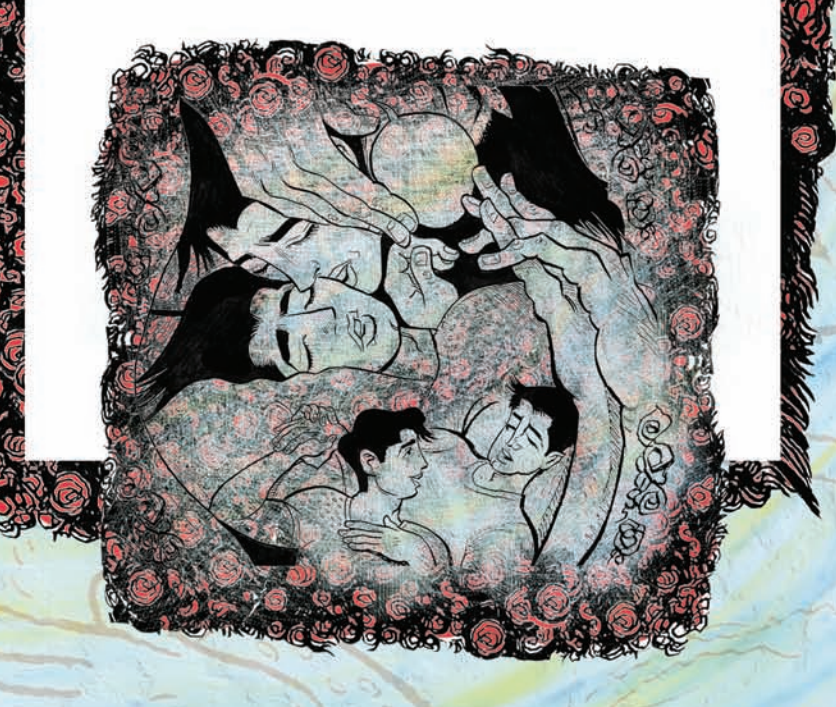
Struggling for family acceptance in Iran: the story of two gay men